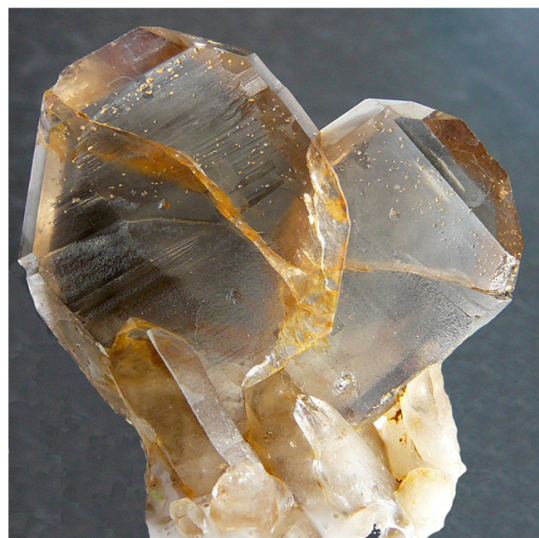
Japan twin in Sally Ann Quartz. Width of twin 4.8 cm (1.9 in); Leland Stanford specimen.