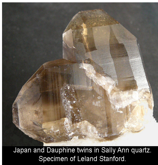
Japan and Dauphine twins in Sally Ann quartz. Specimen of Leland Stanford.